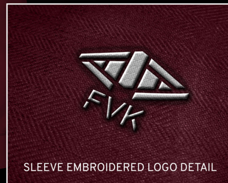
SLEEVE EMBROIDERED LOGO DETAIL